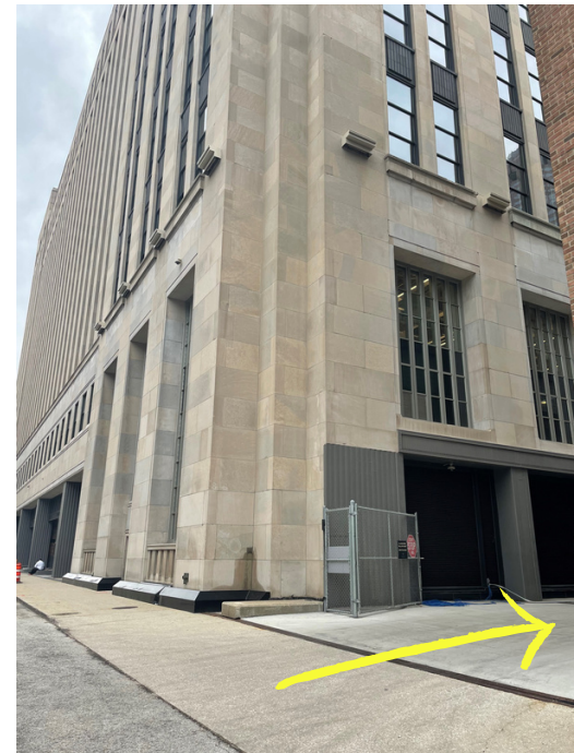
Entrance to access parking garage

The Old Post Office features an on-site, indoor parking garage that allows you to park at your convenience. Located conveniently off of Harrison Street, guests enjoy direct access to our parking garage.