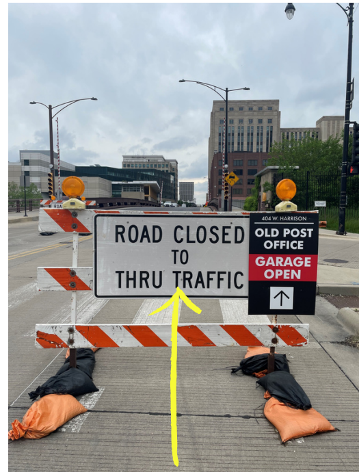
Wacker & Harrison St., looking west; Will need to bypass the "Road Closed To Thru Traffic" sign