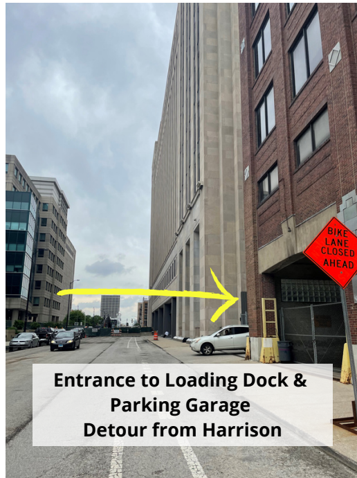
Turn right for parking garage